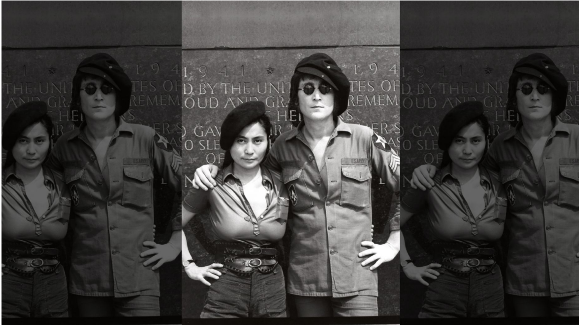
Yoko Ono (L) and John Lennon