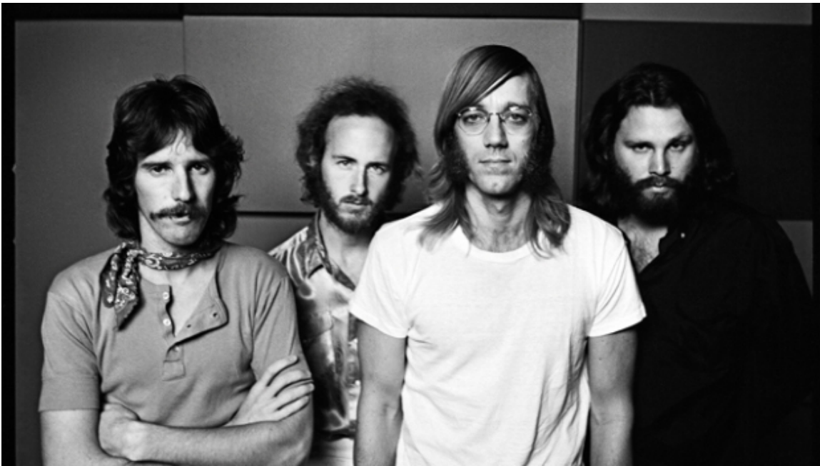
The Doors (l-r): John Densmore, Robby Krieger, Ray Manzarek and Jim Morrison

For the Doors, 1969 was a year marked by singer Jim Morrison's arrest on charges of lewd and lascivious behavior and indecent exposure following the group's chaotic Miami concert. Because of the incident, the rest of the group's tour was canceled. So the Doors--Morrison, guitarist Robby Krieger, keyboardist Ray Manzarek, and drummer John Densmore--were in the studio to work on their next album, "L.A. Woman." But the legal hassles that included a trial were on Morrison's mind.