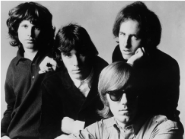
The Doors (l-r): Jim Morrison, John Densmore, Ray Manzarek and Robby Krieger.